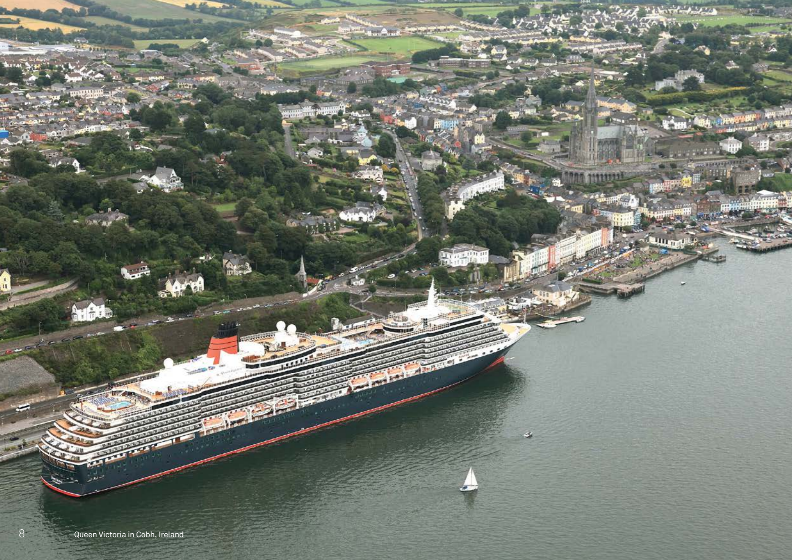
Queen Victoria in Cobh, Ireland